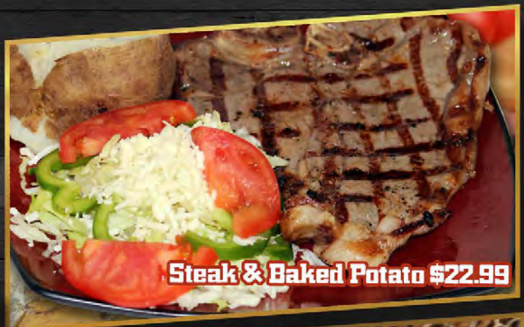
Steak & Baked Potato $22.99