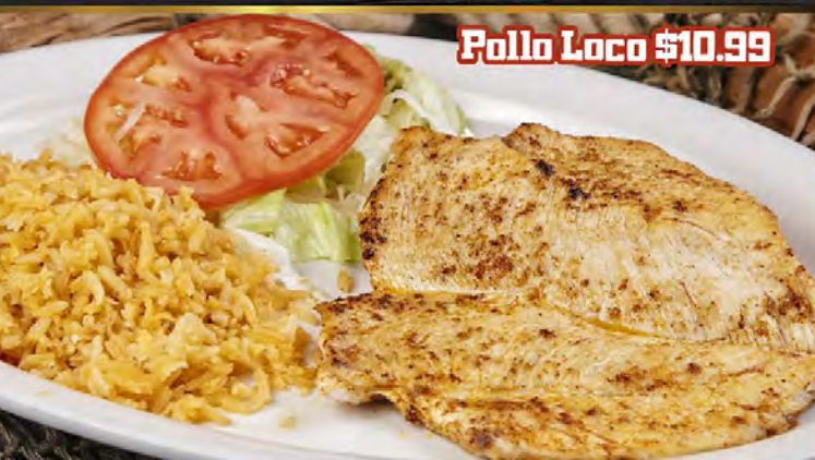
Pollo Loco $10.99