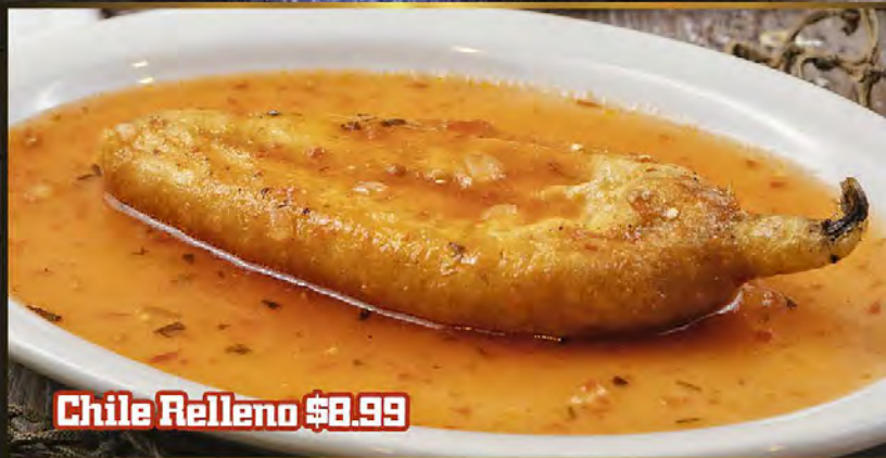
Chile Relleno $8.99