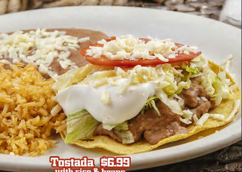
Tostada $6.99 with rice & beans

Thin cut steak topped with grill onions and jalapeño toreado, Served with guacamole, pico de gallo, lettuce, rice and beans, with 3 flour tortillas $14.99