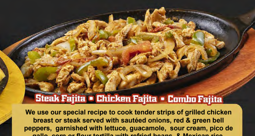
Steak Fajita • Chicken Fajita • Combo Fajita

We use our special recipe to cook tender strips of grilled chicken breast or steak served with sautéed onions, red & green bell peppers, garnished with lettuce, guacamole, sour cream, pico de gallo, corn or flour tortilla with refried beans & Mexican rice.