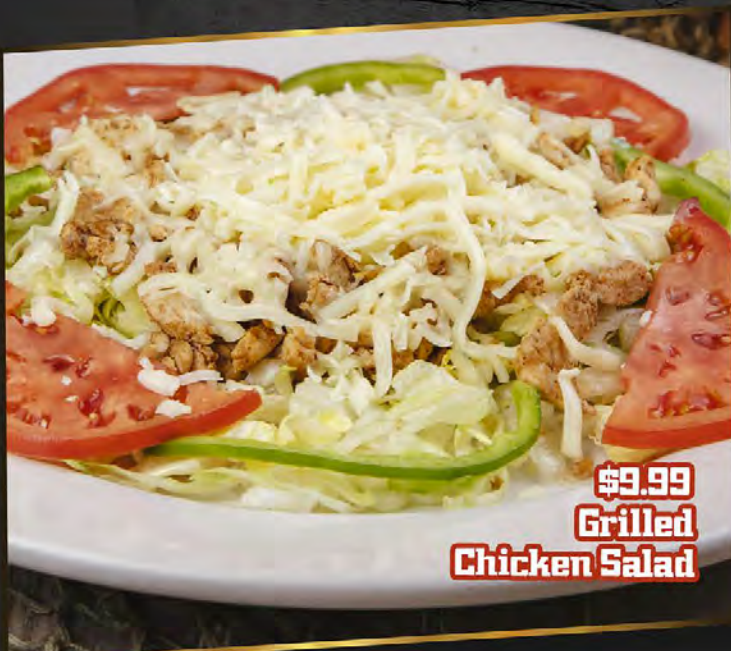
$9.99 Grilled Chicken Salad