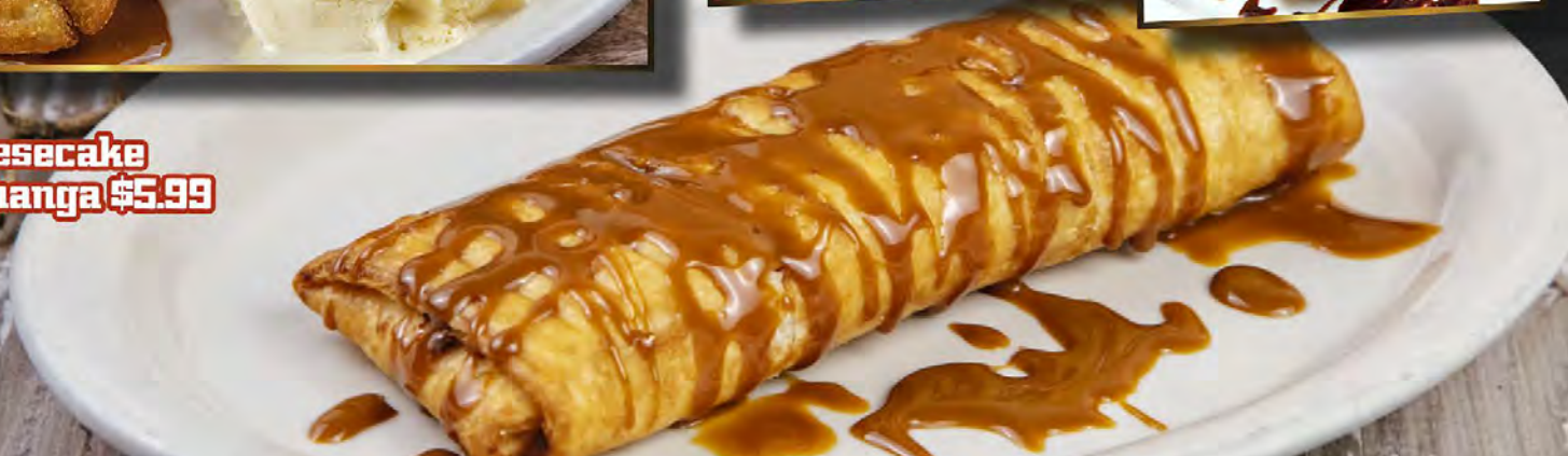
Cheesecake Chimichanga $5.99