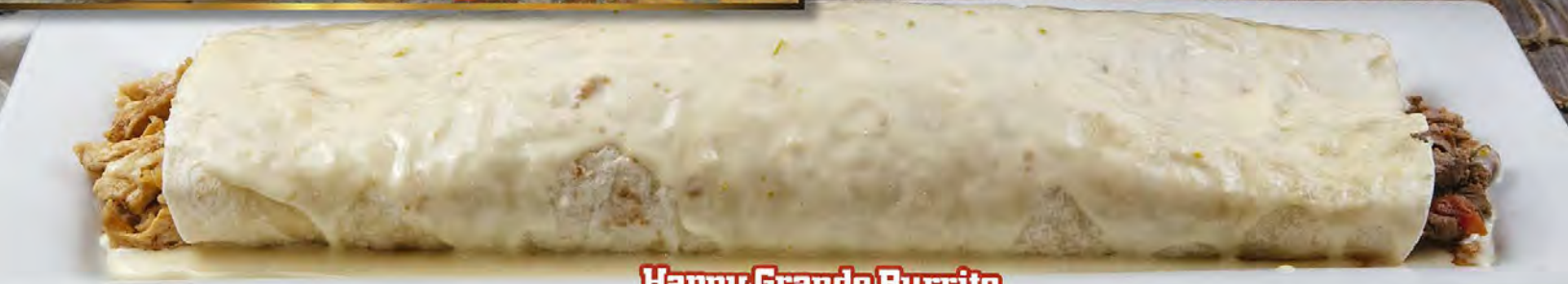
Happy Grande Burrito