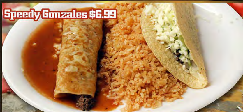
Speedy Gonzales $6.99

(Ranch style eggs) Two eggs topped with Ranchero sauce, rice, beans & three flour tortillas. $6.99