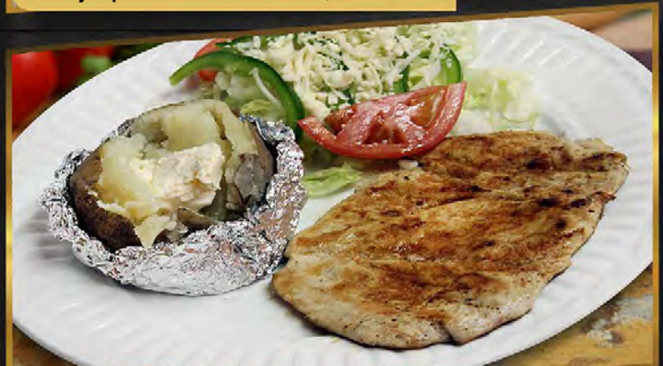
Grilled Chicken Breast $10.99

Strips of marinated steak, chicken, mixed or shrimp on a bed of Mexican rice & topped with cheese sauce.