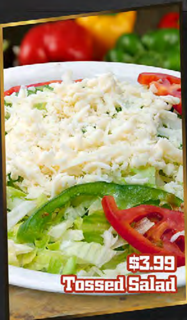
$3.99 Tossed Salad

A crisp flour tortilla with your choice of grilled chicken breast or stripped steak, grilled onions, red & green bell pepper, covered with lettuce shredded cheese, sour cream and pico de gallo. $10.99