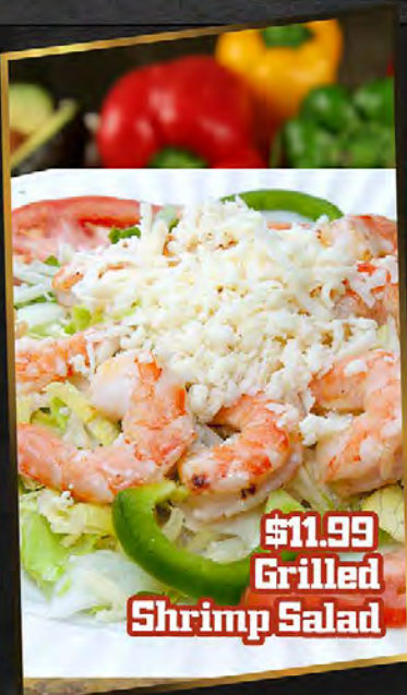
$11.99 Grilled Shrimp Salad