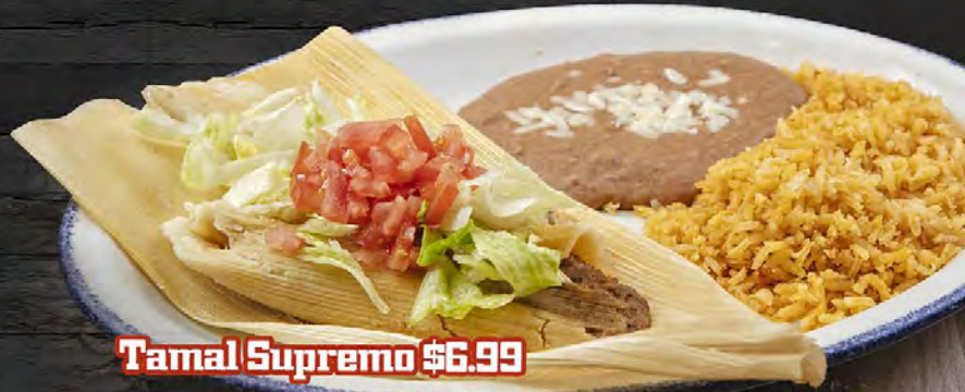
Tamal Supremo $6.99