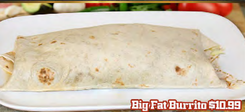
Big Fat Burrito $10.99

A hot burrito filled with chicken, Mexican rice and refried beans. Topped with ground beef, burrito sauce, cheese sauce and sour cream. $9.99