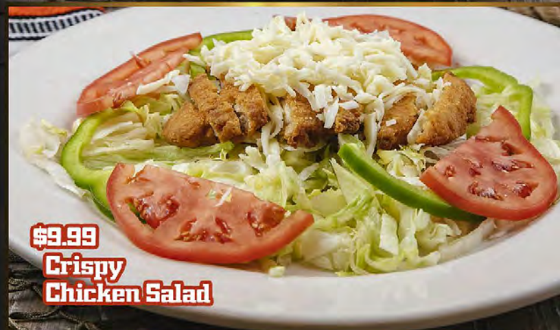
$9.99 Crispy Chicken Salad