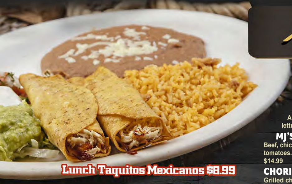
Lunch Taquitos Mexicanos $8.99