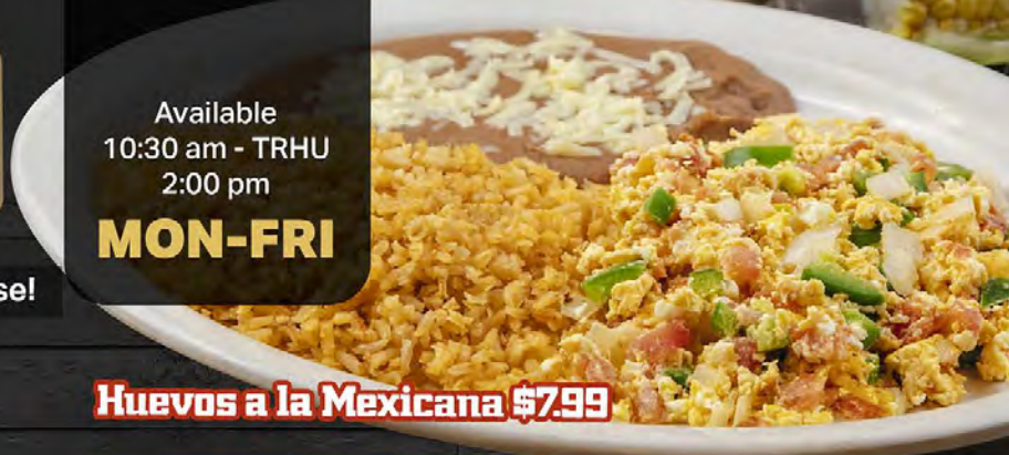
Huevos a la Mexicana $7.99

Seasoned ground beef, chicken, bean & cheese!